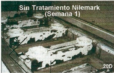
Without Nilemark Treatment Week 1